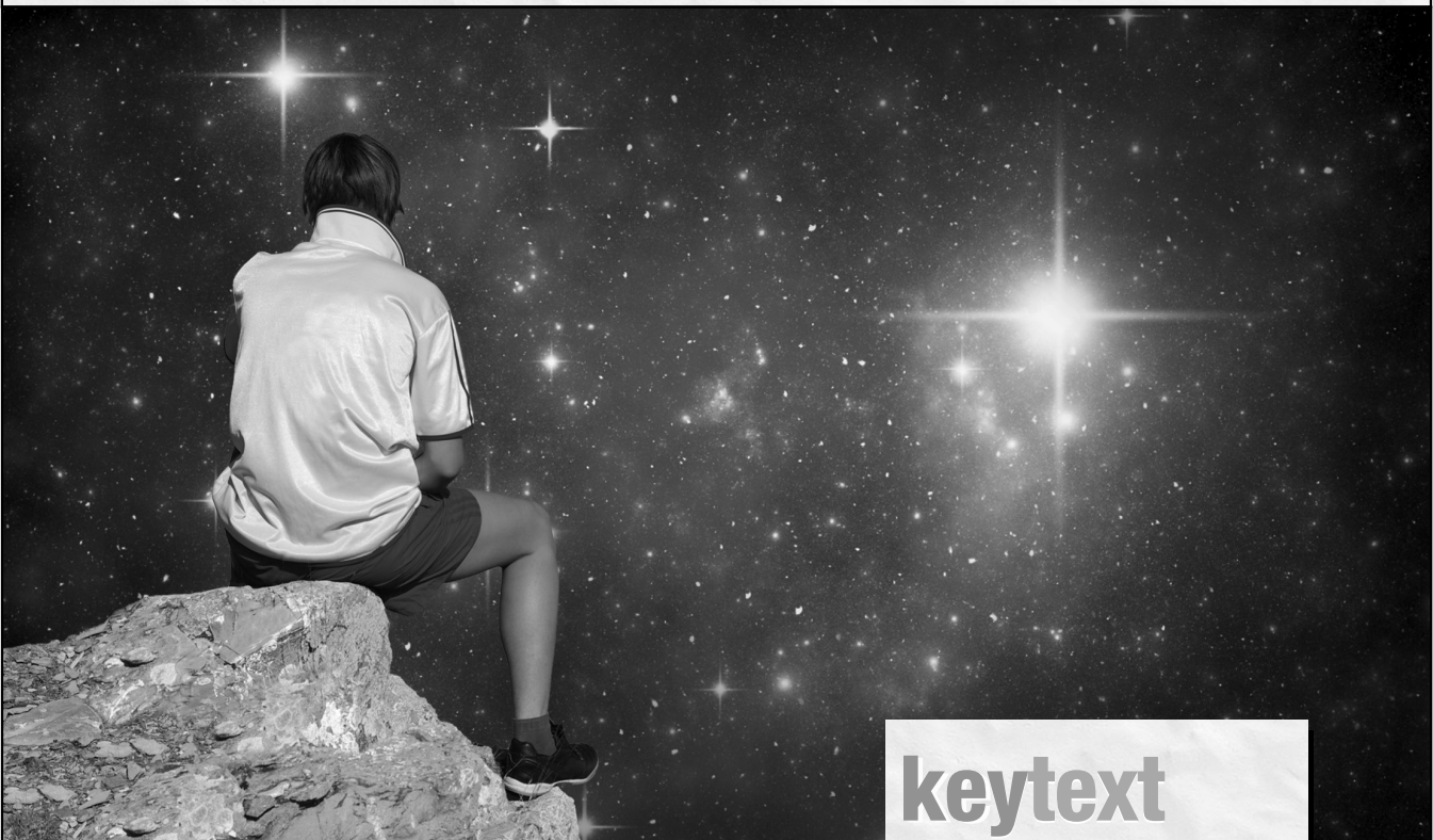
Photo by Jupiterimages Corporation © 2010/Digital photocomposing by Truman