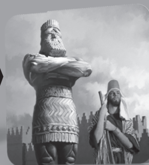
THE CAPTIVITY IN BABYLON

The Bible is one continued story of the history of God's love for humankind. The various names we give it are an indication of that fact: The Plan of Salvation , The Great Controversy Between Christ and Satan , Eden Lost to Eden Regained , to name a few. Like any well-written story, the Bible contains both major and minor events. Certain Bible stories tell of major turning points in human history. These are events that change life forever. Six of these stories have been pictured for you as pillars to make a framework on which to hang all the events of the Bible: Creation, the Flood, the Exodus (from Egypt), the Captivity (in Babylon), Jesus' first coming, and Jesus' second coming.