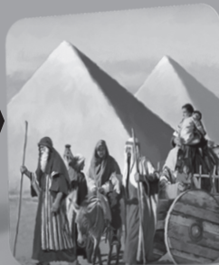
THE EXODUS FROM EGYPT