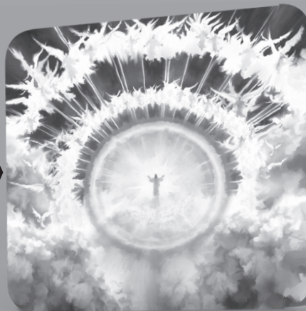
THE SECOND COMING OF JESUS