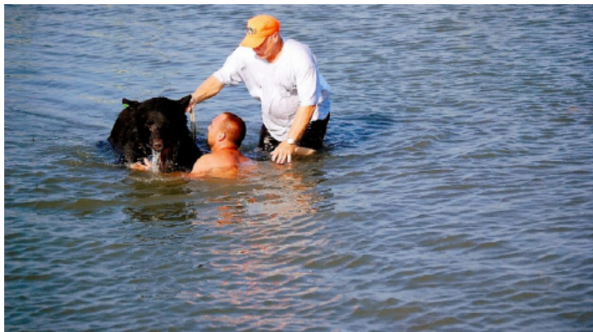
The bear weighed too much for the crew to handle, so they used a tractor bucket to move the sedated bear.