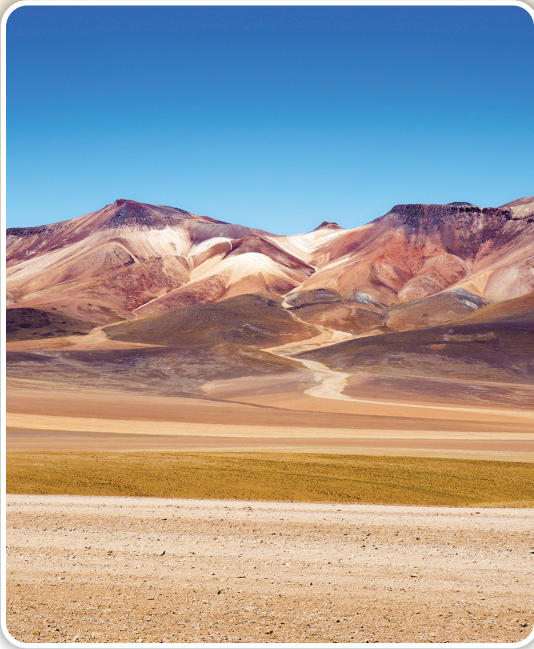
A view of rolling hills in Bolivia.

everlasting gospel did not stop. As a result of the hilltop miracle meetings during the pandemic, 13 people gave their lives to the Lord through baptism. Today, the faithful hilltop group has become a company of more than 50 members who meet every Sabbath in a rented hall. 🌐