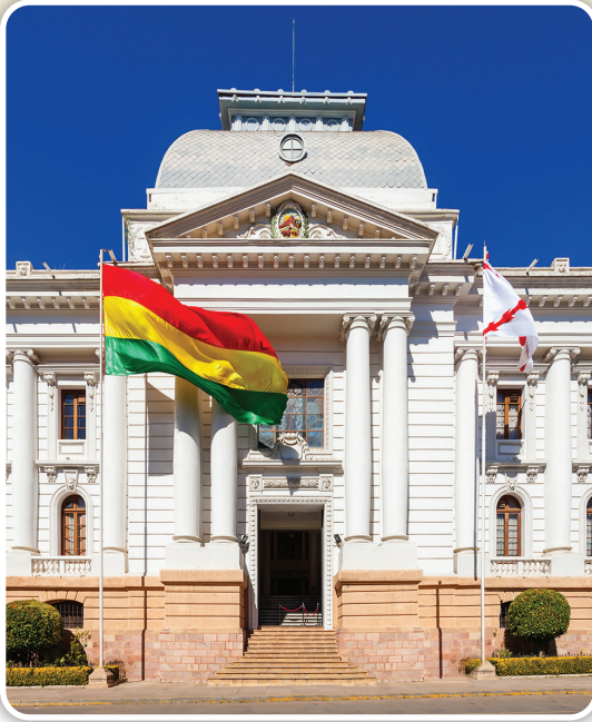
A view of the Supreme Court of Bolivia.

very time consuming, but the good Lord intervened, and the Supreme Court ruled in favor of the Adventist Church in only 30 days. The church received the title to the property, and plans were put into place to construct a new church building and healthy lifestyle center.