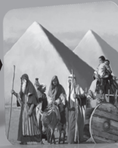
THE EXODUS FROM EGYPT