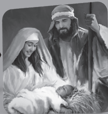
THE FIRST COMING OF JESUS