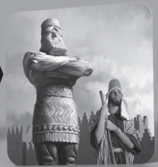
THE CAPTIVITY IN BABYLON

The Bible is one continued story of the history of God's love for humankind. The various names we give it are an indication of that fact: The Plan of Salvation, The Great Controversy Between Christ and Satan, Eden Lost to Eden Regained , to name a few. Like any well-written story, the Bible contains both major and minor events. Certain Bible stories tell of major turning points in human history. These are events that change life forever. Six of these stories have been pictured for you as pillars to make a framework on which to hang all the events of the Bible: Creation, the Flood, the Exodus (from Egypt), the Captivity (in Babylon), Jesus' first coming, and Jesus' second coming.