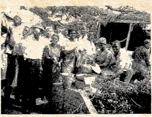
A Happy Group of Master Guide Campers Washing Dishes After Lunch.