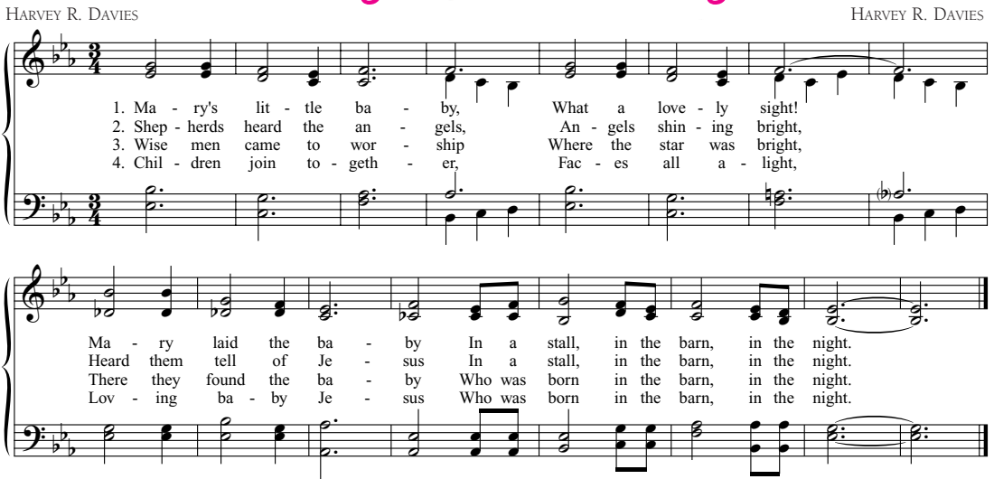
Copyright © 1955 by Review and Herald® Publishing Association.